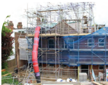
Project converting two terrace houses into high quality homeless accommodation