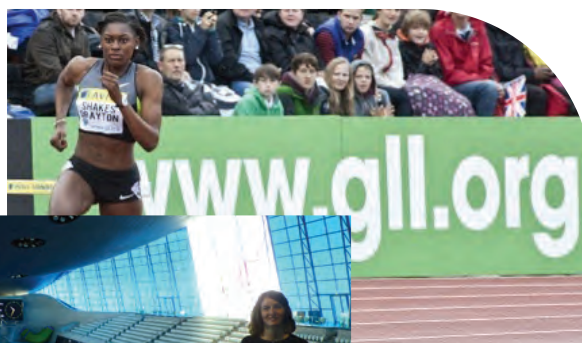
Sponsoring the London Olympics 2012