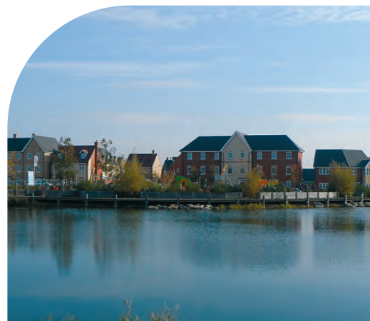
A range of housing projects