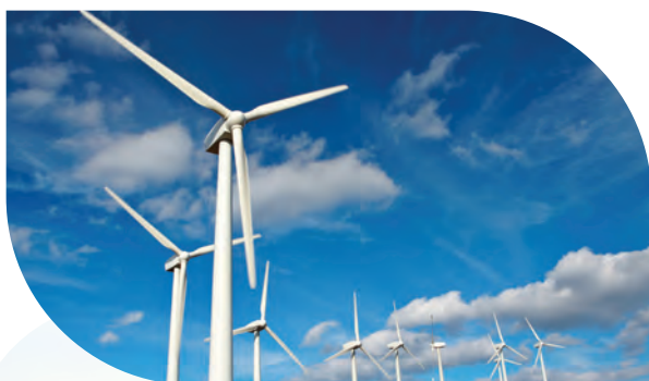
504 mega watt wind farm