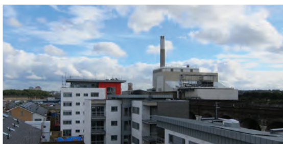
Central heating from waste plant