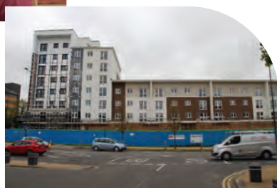
Project redeveloping Marylands plaza into social and affordable homes