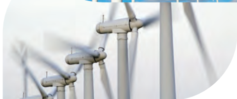
No construction risk