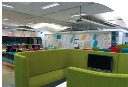
Community employment support project