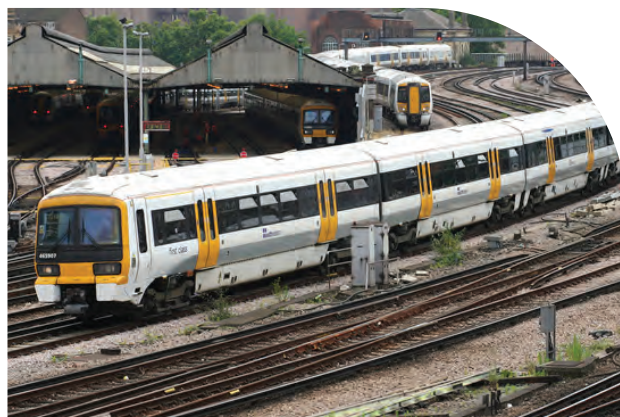
Taking you from A to B