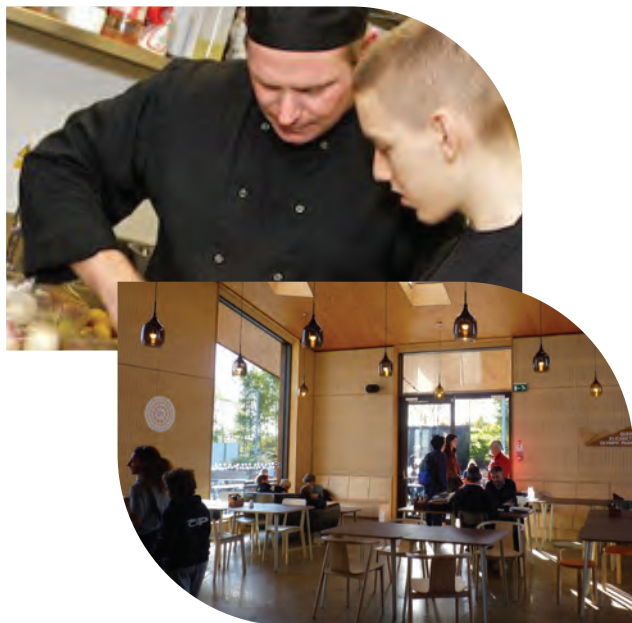
Camden Society enterprise cafes