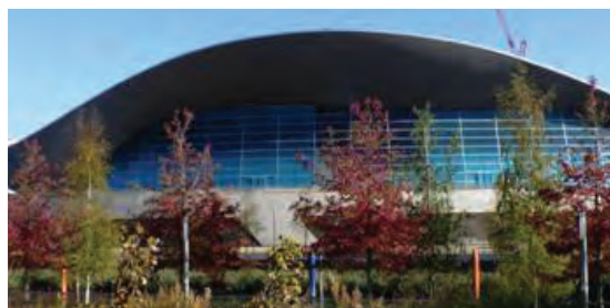
GLL leisure centre