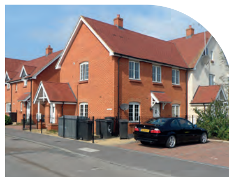
High quality social housing