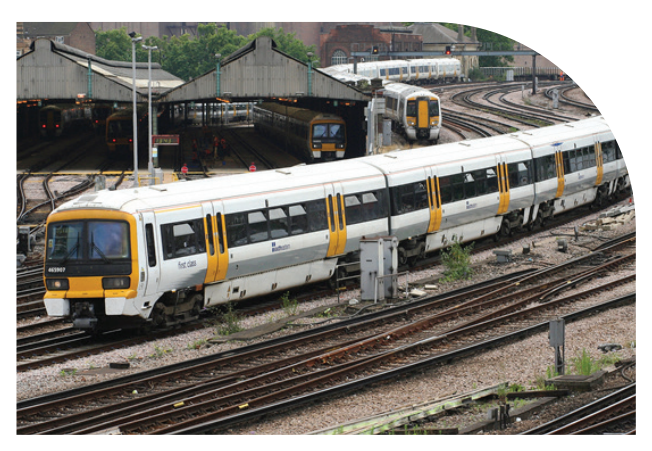
Taking you from A to B