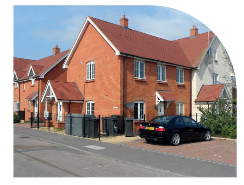
High quality social housing