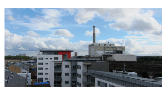
Central heating from waste plant