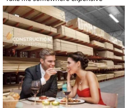
"Take me somewhere expensive"